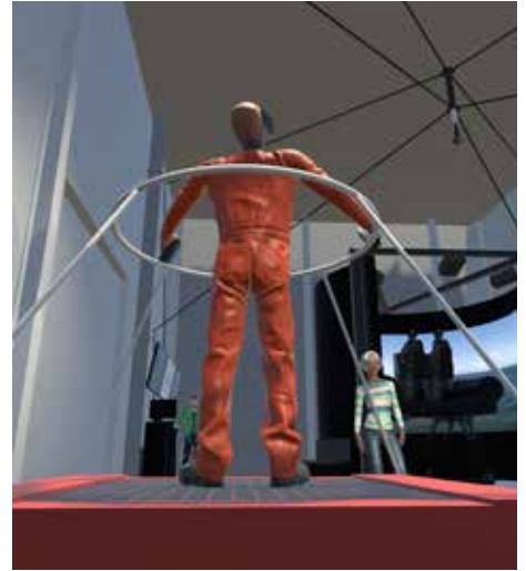
Maritime eXperience Lab with motion platform/treadmill, Cable Robot and Fast Small Ship Simulator (FSSS) at the background