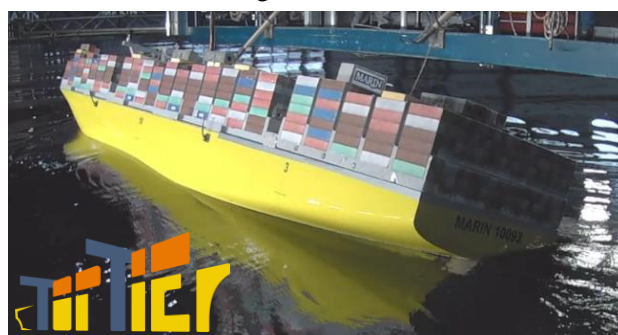
Figure 2: Example of parametric roll in following seas for a 10,000 TEU container vessel (wave height 4 m, wave period 11.9 s, vessel speed 10.6 kn, max. roll angle 19.7 deg)

Particular concern in TopTier was raised to parametric roll in following seas conditions. The incident reviews suggested this likely played a role in the 2019-2020 incidents. Model tests performed within the project (see Figure 2) confirmed that ULCS vessels are more sensitive than expected to this response mode because of low GM conditions in full load conditions combined with low speeds due to port congestion and Easterly swells in winter time. An Excel support tool and explanatory video were circulated to explain the phenomenon and recognise enabling conditions prior to occurrence of extreme motions. This requires conscious observations that remain difficult to perform for instance at night time. Objective sensor based indicators alerting to enabling conditions for parametric rolling and screening wave conditions are to be evaluated and validated over coming months.