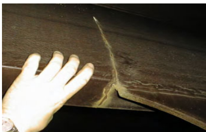
Crack in stiffener

The Advisory Hull Monitoring System (AHMS) is an advanced hull monitoring system, which shows, explains and advises on fatigue integrity of floating structures. It explains reasons for potential deviation of the actual fatigue consumption from design predictions and translates the monitoring data into operational guidance and advice in an easily understandable format. Therefore, it also provides the designers with feedback on the quality of their design tools. The methodology and specifications of AHMS have been developed within a Joint Industry Project (MONITAS) of 16 participants including the major oil companies and class societies.