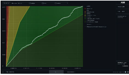
Screenshot Octopus Monitas software