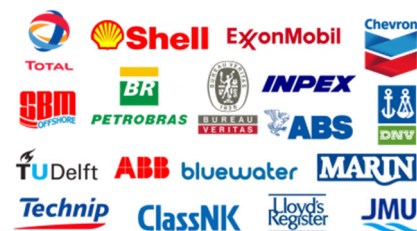
Monitas JIP participants

An Advisory Hull Monitoring System comprises strain measurements at cold spot locations. These locations are characterized by a uniform stress distribution. For these locations, the system not only determines the measured lifetime consumption but also calculates real time by means of the floater design tool the predicted and calculated lifetime consumption, based on the design conditions and the actual measured conditions. For this reason, the floater design tool is part of AHMS. Based on the measured, calculated and predicted lifetime consumption at the cold spot, tool accuracy factors and prediction accuracy factors are determined, which can be applied at the analyses of the (critical) hot spot locations. For more detailed information reference is made to the publication described by L'Hostis, Kaminski and Aalberts in 'Overview of the Monitas JIP', Offshore Technology Conference, 3-6 May 2010, Houston, Texas, USA, OTC-20872.