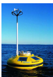
Directional wave rider buoy