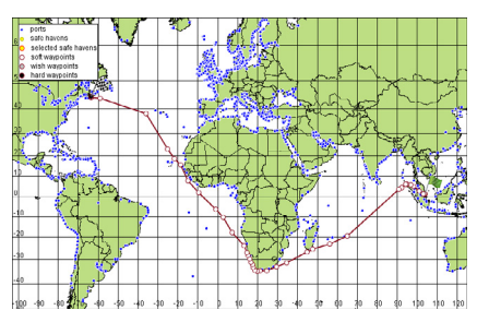
Routes can be quickly selected and reviewed using the graphical map interface. Databases are included for safe-havens, wind and waves, bathymetry, and marine hazards.