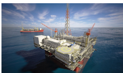
The Ichthys platform