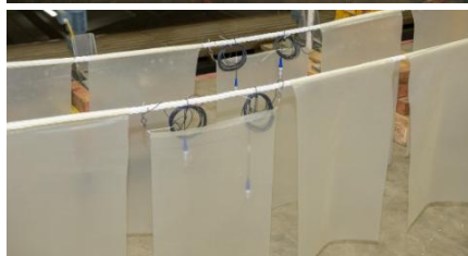
Seaweed modelled by making use of surrogate material. Top figure: fully moored multi long line model (scale 1:25). Bottom figure: Laminaria digitata surrogate (1:1)