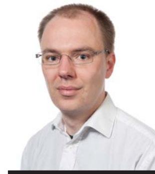
BY EVERT-JAN FOETH